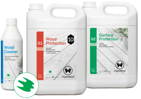
Good Environmental Choice

Maintenance washing with OrganoWood® Wood Cleaner is recommended. If the surface is mechanically worn, for example where people often walk or move furniture, or if the surface is washed with a strong wood cleaner or high-pressure washing (should be avoided), the wood fibres in the surface layer may be worn away and thus also the treatment. If necessary, re-treat with 02 Surface Protection. Following significant wear or heavy-duty cleaning, worn sections may also need to be re-treated with 01 Wood Protection.